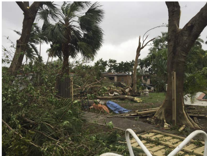
NWS Storm Survey picture from Miami Springs on January 23 rd , 2017

South Florida tornadoes occur mostly from May to August when thunderstorms are most frequent (Figure 1), however they have occurred in every month. Most South Florida tornadoes are relatively small and short-lived. This means that it is often very difficult to give plenty of advance warning. In many cases, only a few minutes of warning are given between the time a warning is issued by the National Weather Service and the tornado touchdown. Nevertheless, even a few minutes of warning can make the difference between life and death.