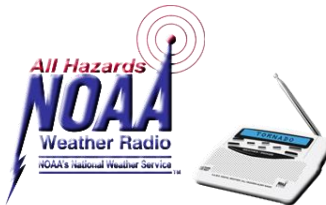
Figure 2: NOAA Weather Radio – important for protecting lives and property.

Knowing how to receive weather warnings is critical to your safety. Fortunately, there are many ways to get these warnings. One option is owning a NOAA Weather Radio (Figure 2). Having a NOAA Weather Radio is a critical component of the warning system. In fact, having a weather radio available to alert of an approaching tornado has proven to save lives , especially for nighttime tornadoes when people are normally asleep and otherwise wouldn't receive alerts. Local media will also relay tornado warnings via the Emergency Alert System (EAS).