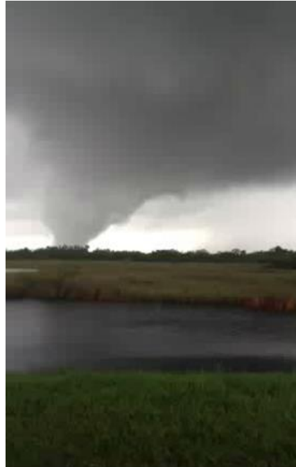
Tornado in Everglades of Collier County on June 24 th, 2012

MIAMI-SOUTH FLORIDA National Weather Service Forecast Office http://www.weather.gov/miami