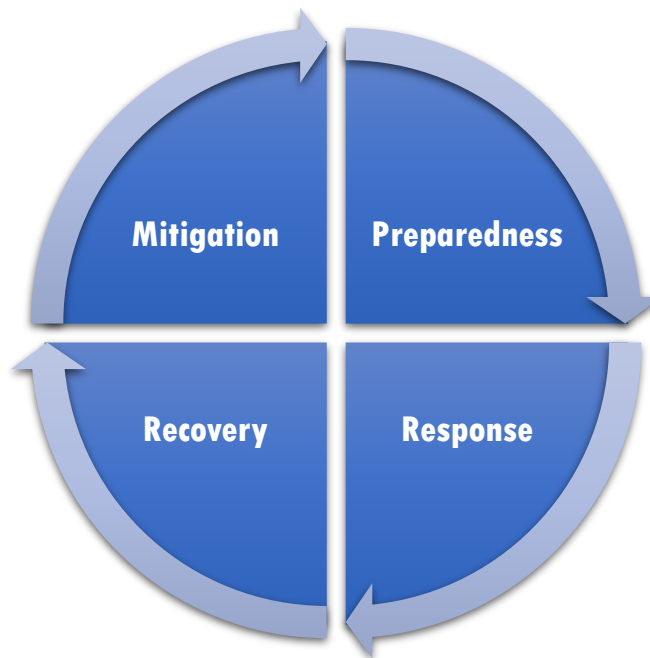
EMERGENCY MANAGEMENT CYCLE